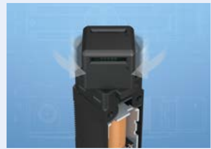
Rotating actuator head Actuator head can be rotated without loosening of screws