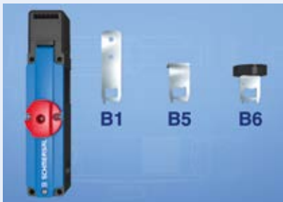
Actuators for all mounting situations B1 (straight), B5 (angled), B6 (flexible)

Solutions for a broad range of applications