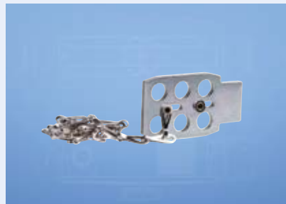
Lockout tag SZ150-1 To prevent inadvertent closing, e.g. during maintenance